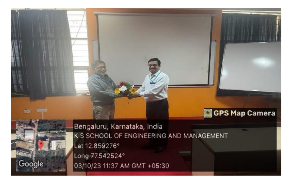
Fig 1: Inauguration of Event

The event was conducted to create awareness to students of KSSEM to understand the importance of ECG, various benefits, opportunities, history and growth of ECG.