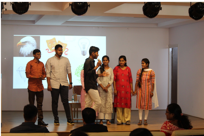
Emcee of the Event: