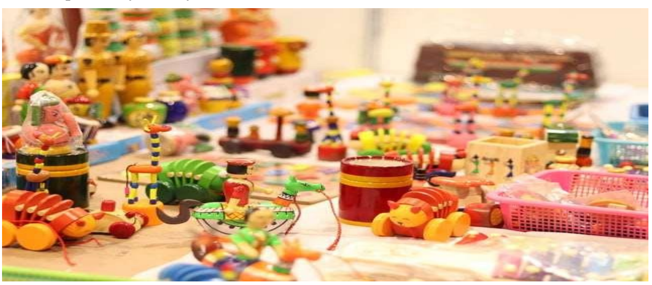
The Enduring Legacy of Channapatna Toys: A Cultural Odyssey