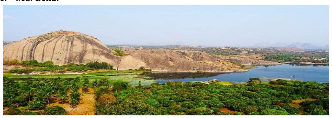
Exploring the Spiritual and Historical Tapestry of Revanasiddeshwara Betta