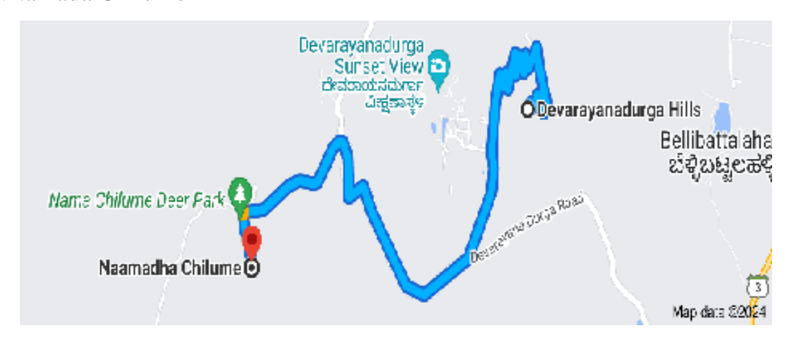
16 min (6.5 km) via Devarayana Durga Road

Five km from Bhoganarasimha temple is 'Namada chilume'. Located on Tumkur-Devarayanadurga road, originally called 'Oralakallu teertha', 'Namada chilume' is a natural spring created at rocky dry spot. Legend apart, the sight of crystal clear water gushing out of a rocky pit is what has made 'Namada chilume' an oft-visited tourist spot. It is situated near the Forest Department's deer park and a green nursery