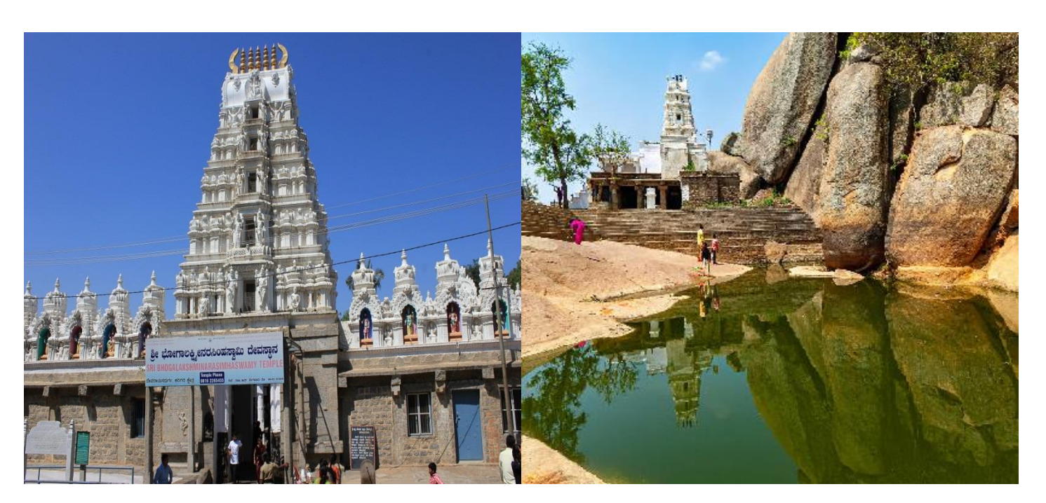
Sri BhogalakshmiNarasimhaswamy Temple