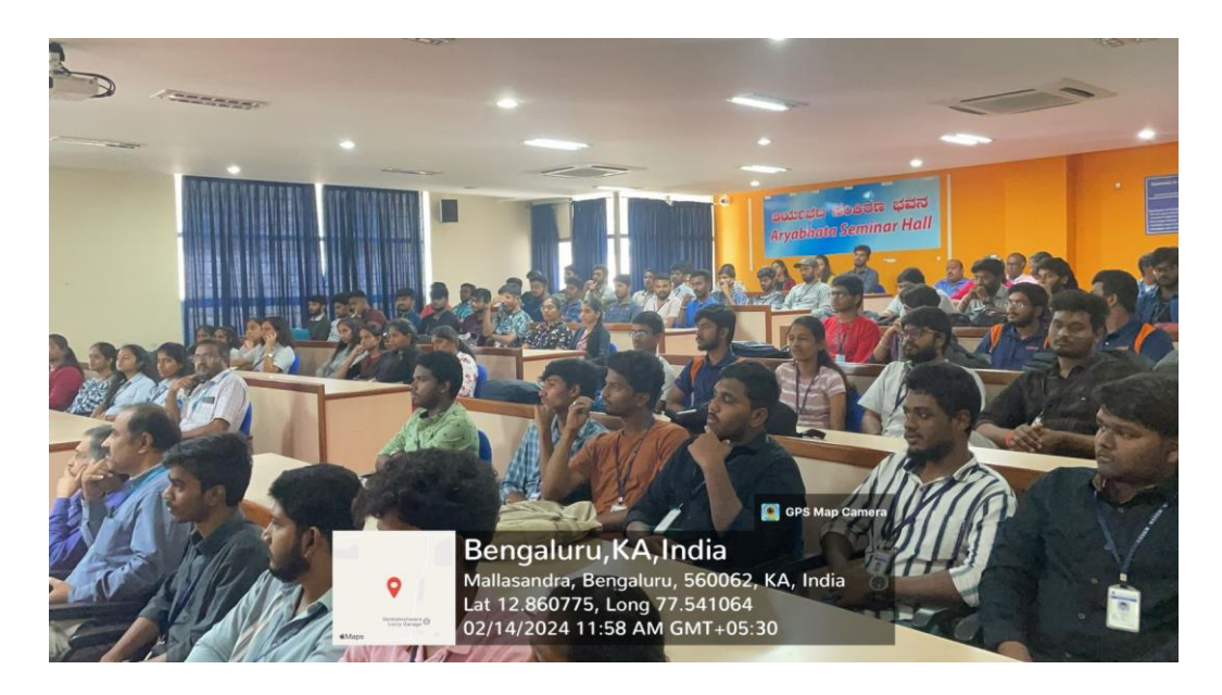
Fig 3. Student Participants in the Event