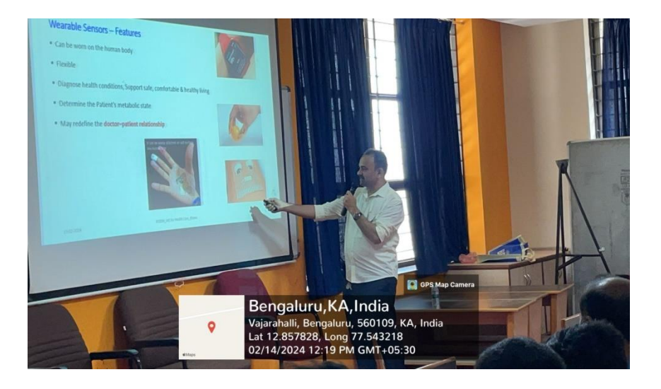
Fig 2. Speaker Addressing the Students

DEPARTMENT OF ELECTRONICS AND COMMUNICATION ENGINEERING