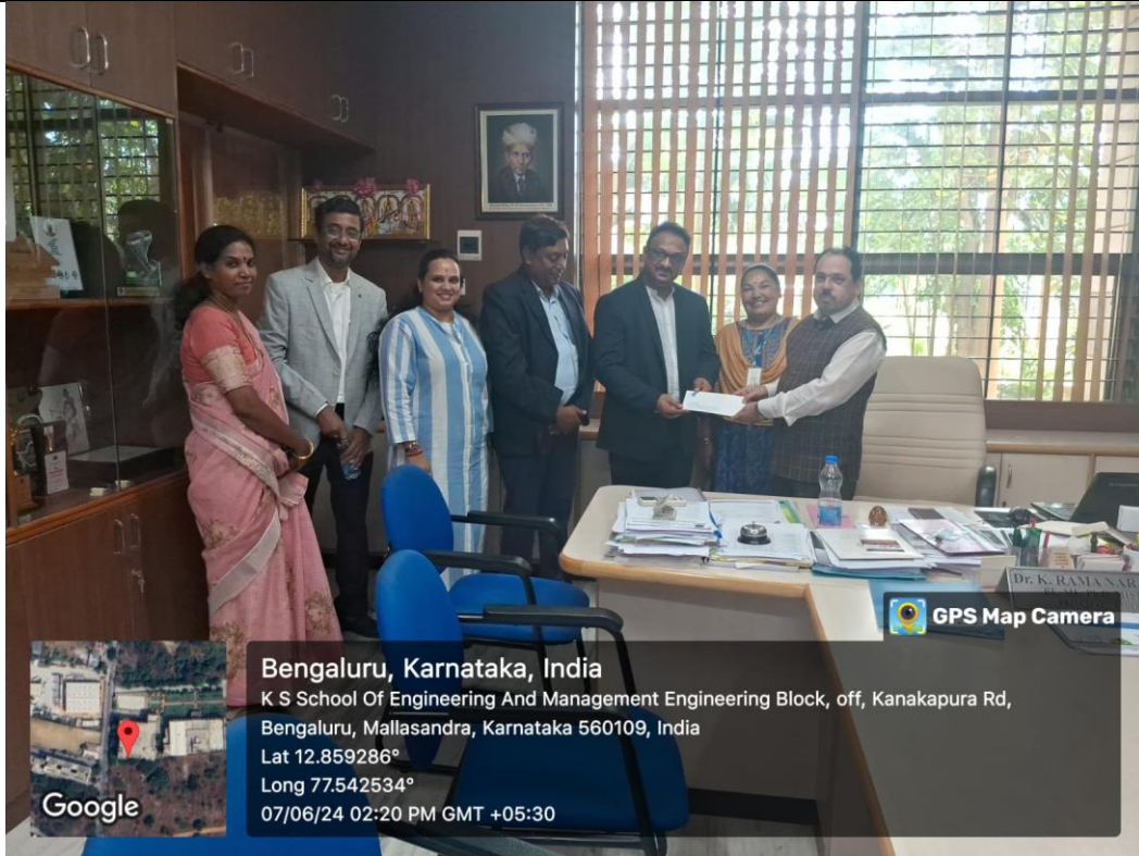
Principal appreciating resource personalities of Acknowledger First