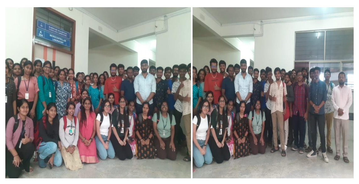
Fig 3. Guest Speaker, Faculties and Students present in the Event