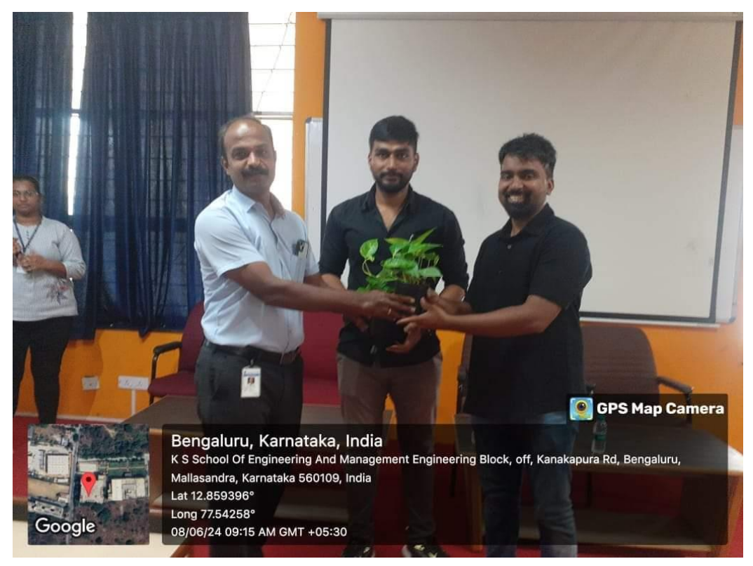
Fig 1. Inauguration of Hands on training on interfacing of sensors

Line Follower Project: One of the highlight projects was the Line Follower Robot. Participants were tasked with designing and programming a robot capable of autonomously following a predefined path using infrared (IR) sensors. The project encompassed sensor calibration, PID (Proportional-Integral-Derivative) control algorithm implementation, and real-world testing. Through this project, attendees gained insights into robot navigation, sensor fusion, and algorithm optimization.