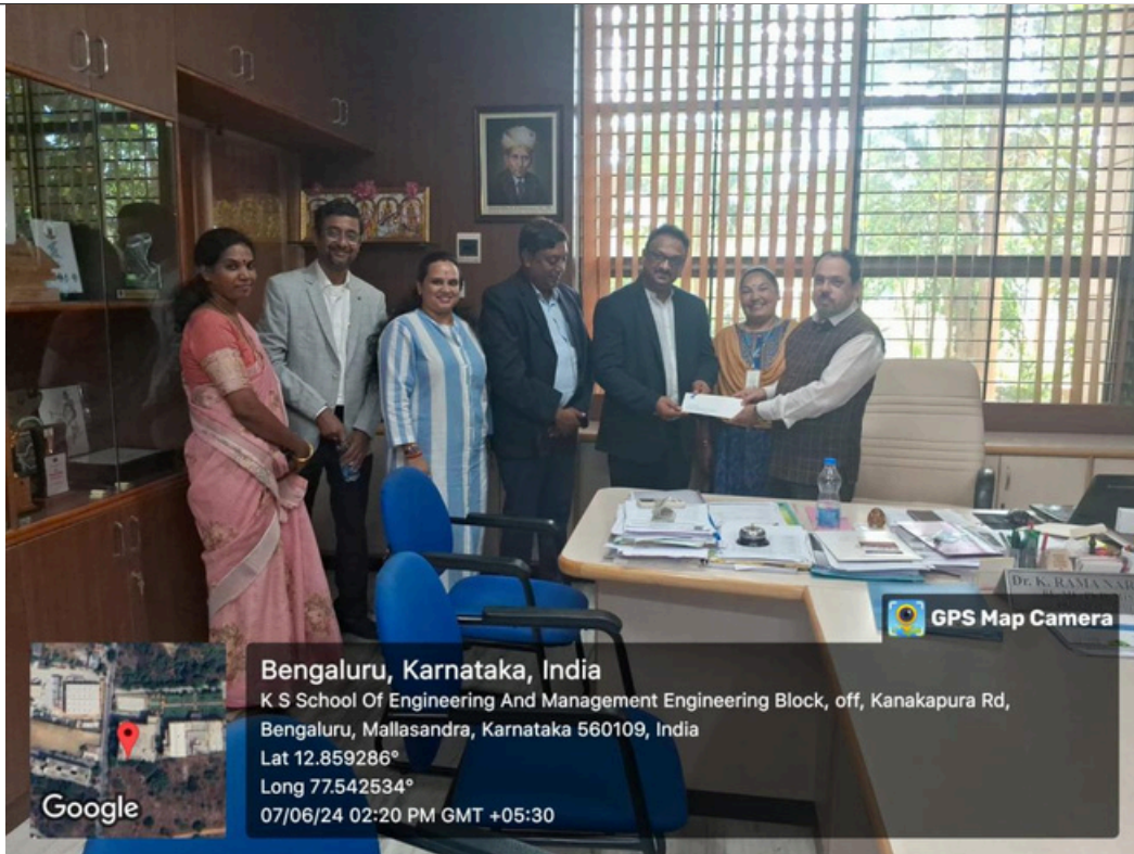
Principal appreciating resource personalities of Acknowledger First