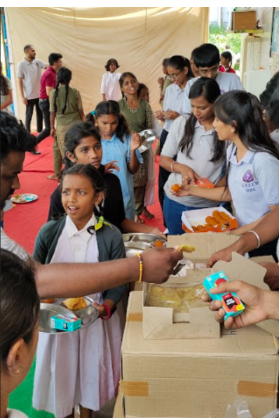
Students performing 'Passing the Ball' – Fun Game and distributing Food and Water bottles for children