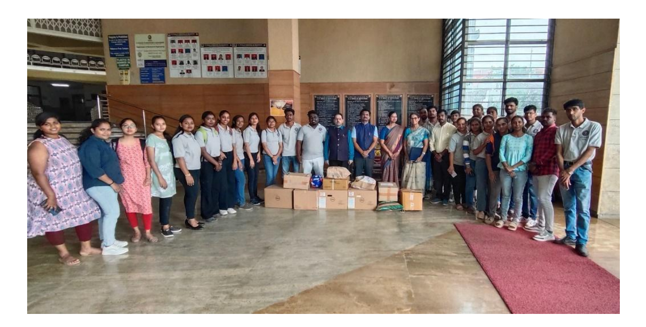
Group Photo before leaving for the orphanage along with Principal and HOD - MBA