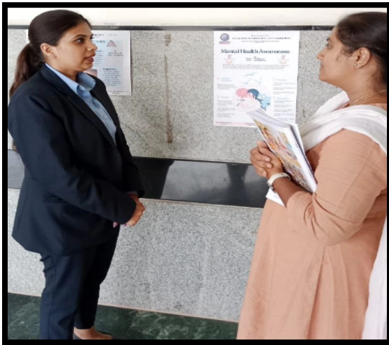
Students presenting their ideas with the poster to judge.