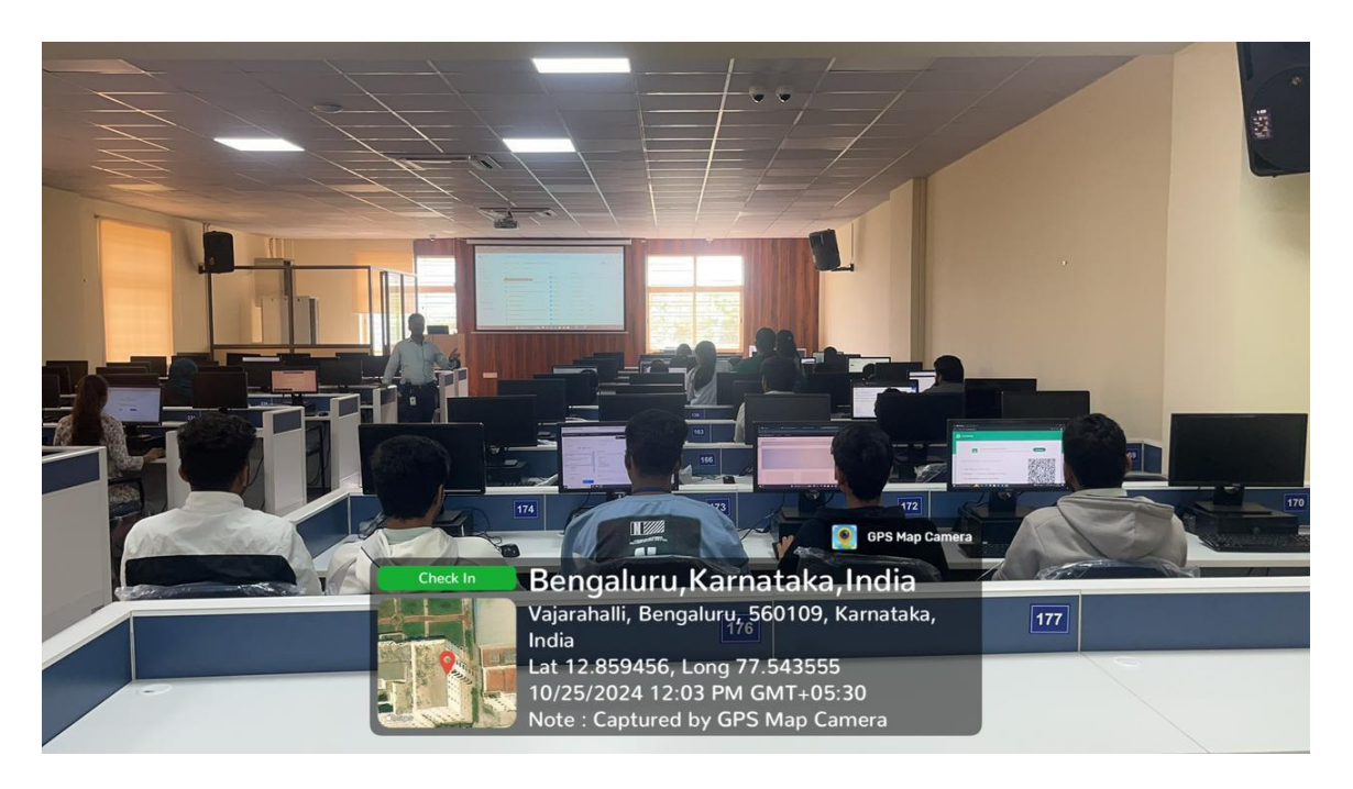
Fig. 3: Interactive session