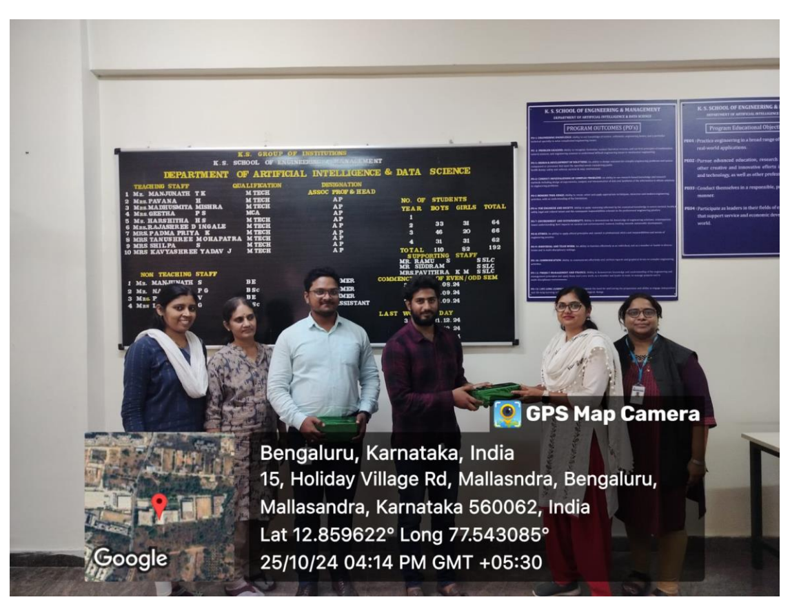
Fig. 4: Felicitating the resource person