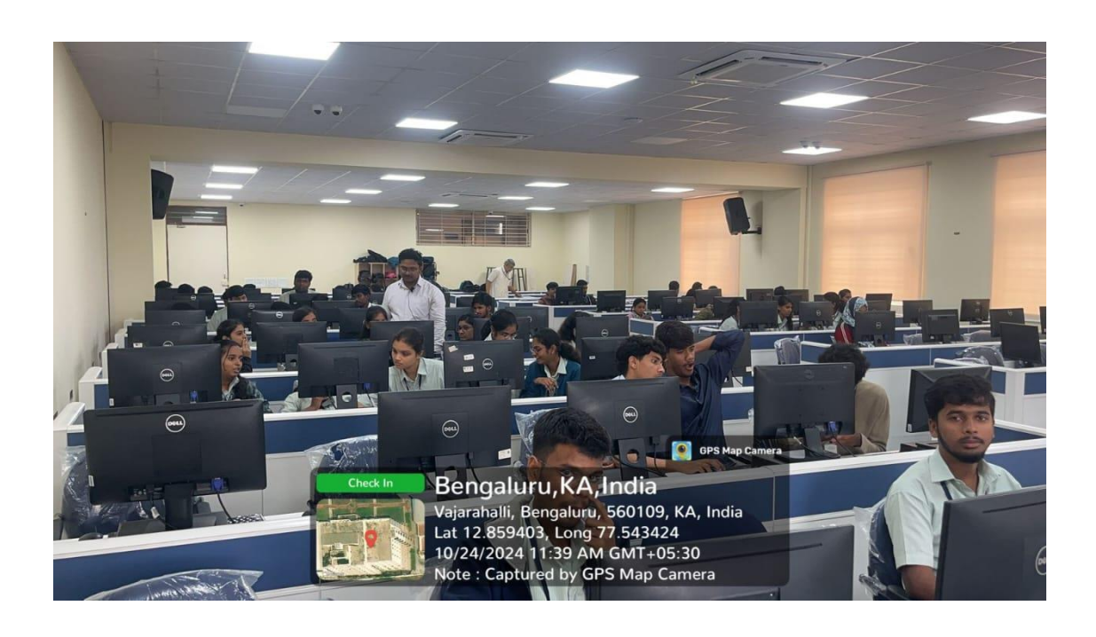
Fig. 2: Hands-on session