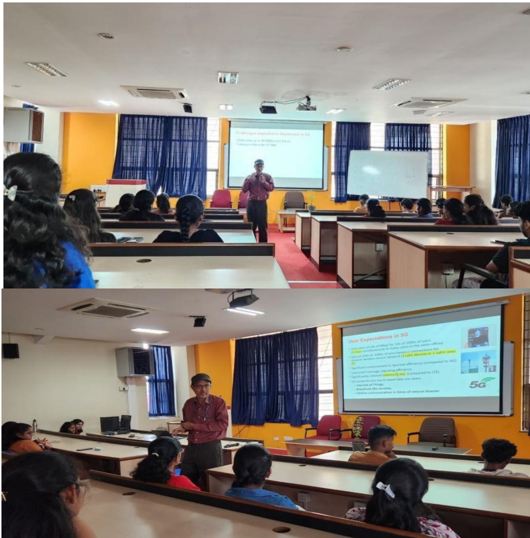
Fig 1. Speaker and audience present in the event