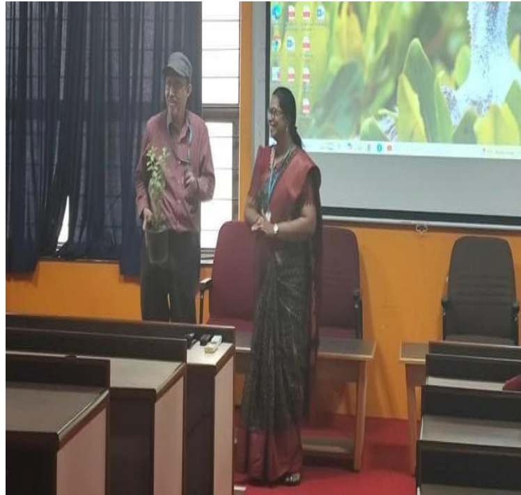
Fig 2. Speaker addressing the event

DEPARTMENT OF ELECTRONICS AND COMMUNICATION ENGINEERING