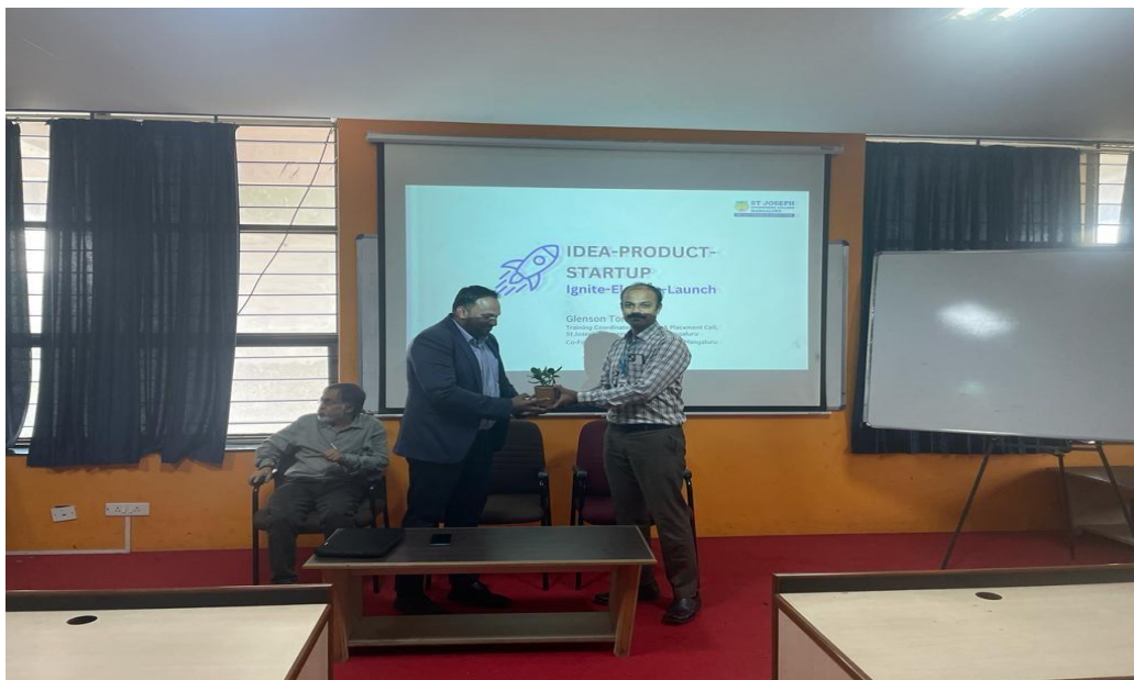
Fig 1: Inauguration of Event

Turning an idea into a tangible product is a process that can require time, labor and money to complete. If you have an idea for a new product, following the proper steps from idea to salable product can greatly increase your chances of success. Learning about these steps can help you formulate a plan of action for a product a company sells.