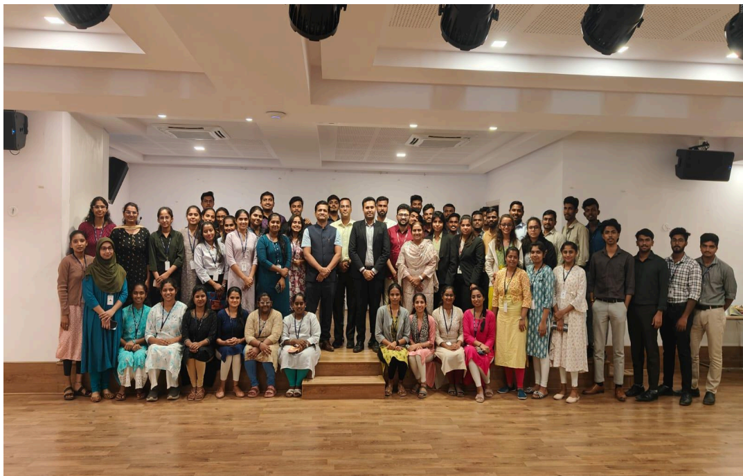
Group Photo with Resource Person