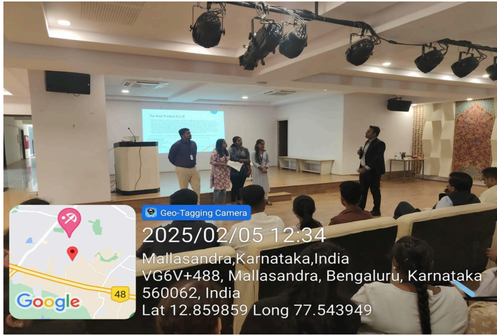
Students presenting their product ideas as a team