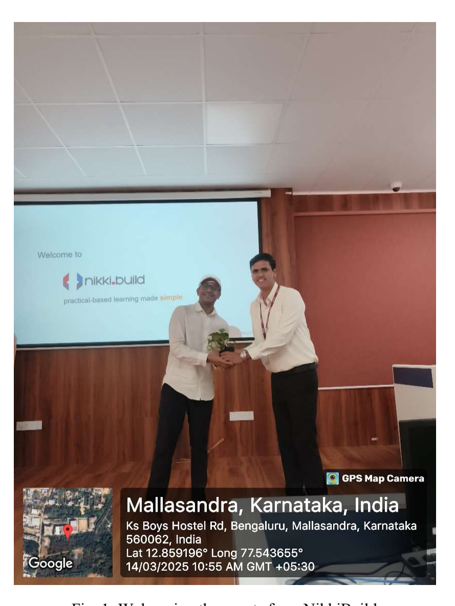
Fig. 1: Welcoming the guests from NikkiBuild