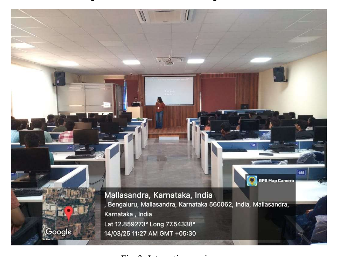
Fig. 3: Interactive session