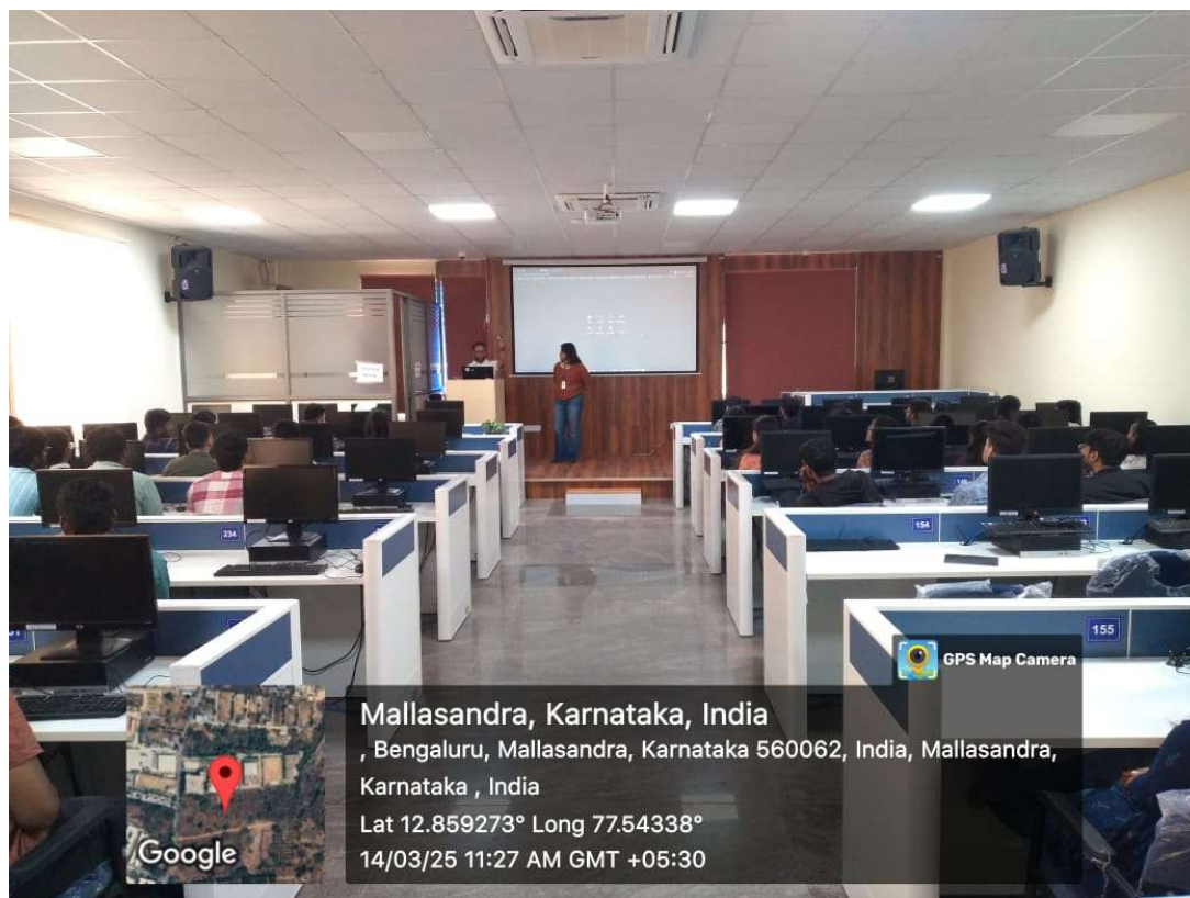
Fig. 3: Interactive session