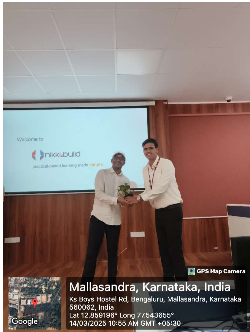
Fig. 1: Welcoming the guests from NikkiBuild