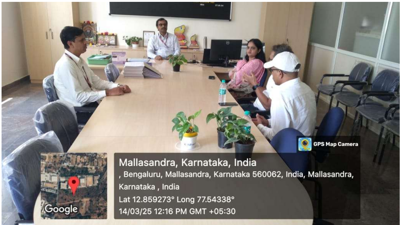
Fig. 5: Guests interacting with HOD and Staff Members