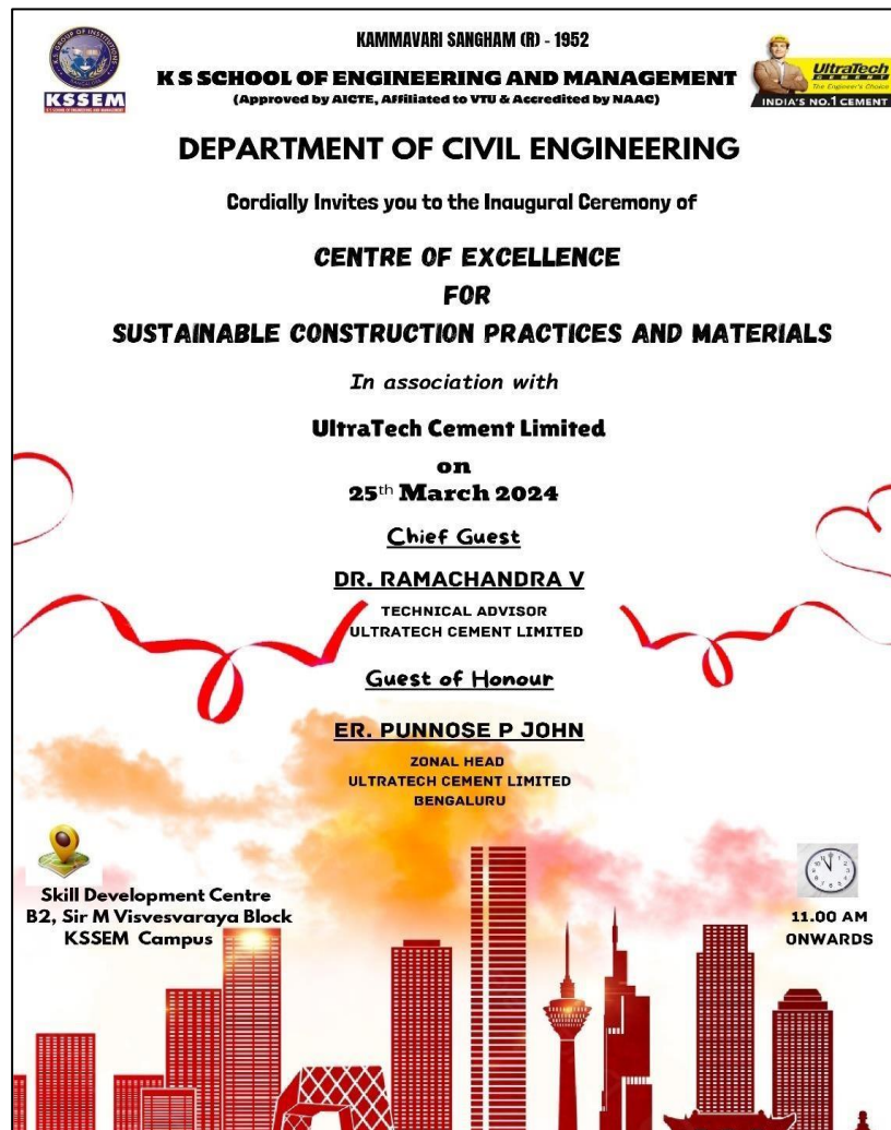
Figure: 2.2.4.1 Inauguration Brochure of Centre of Excellence

The Department of Civil Engineering has proudly established the " Centre of Excellence for Sustainable Construction Practices and Materials " in collaboration with UltraTech Cement Limited , marking a significant step towards fostering industry-academia interaction. Inaugurated on 25th March 2024, this centre aims to bridge the gap between theoretical knowledge and practical application by creating a platform for students to engage with industry experts, cutting-edge technologies, and innovative construction practices. Focused on sustainability, the centre will provide opportunities for students and professionals to explore advanced materials, techniques, and solutions that address the challenges of modern construction. This collaboration not only enhances the learning experience but also equips future engineers with the skills and knowledge required to contribute effectively to the construction industry while promoting environmentally responsible practices.