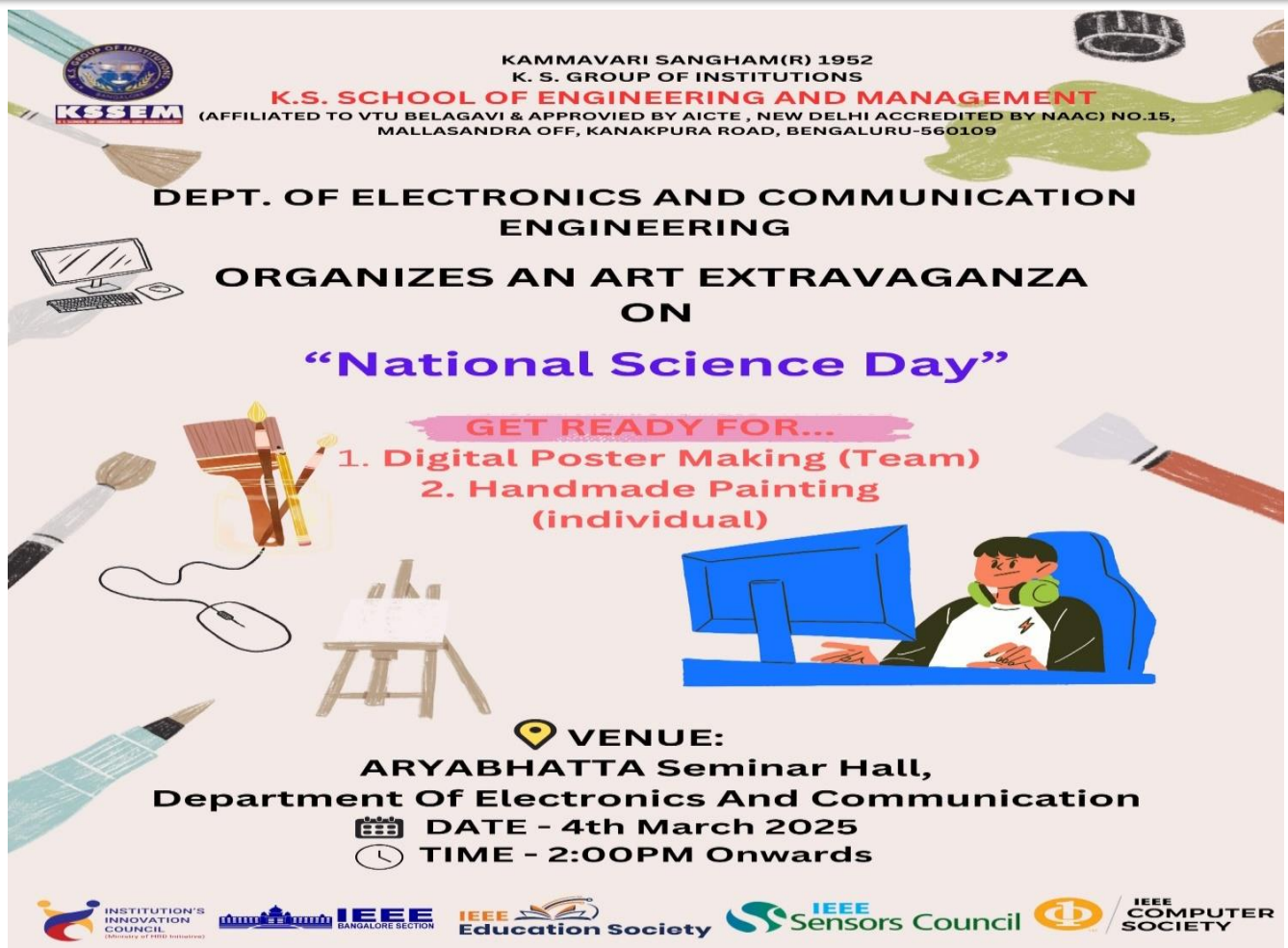
Fig 1.1: Poster of the Event

DEPARTMENT OF ELECTRONICS AND COMMUNICATION ENGINEERING