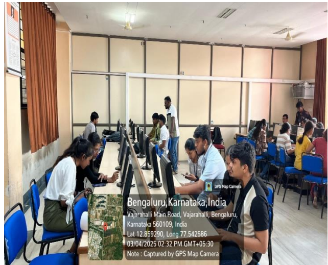
Fig 1.3: Digital poster making photo 2