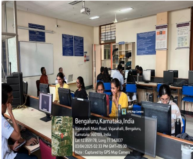
Fig 1.2: Digital poster making photo 1