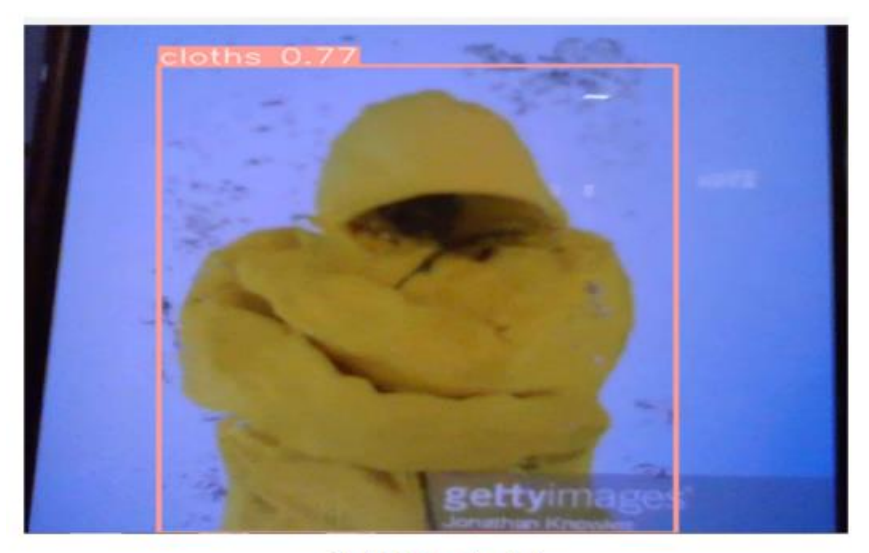
Fig 8.3 Detecting cloth