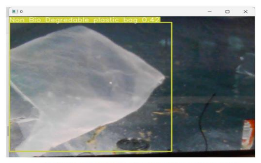
Fig 8.4 Detecting plastic bag and classifying it into non-biodegradable