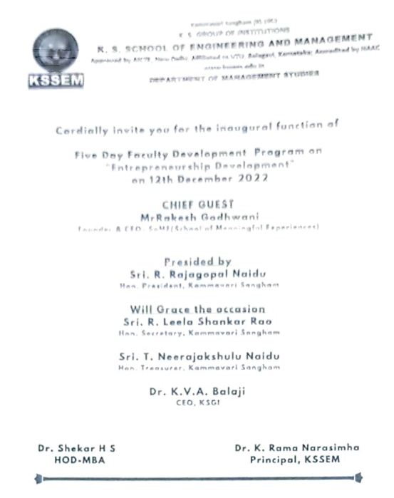
Venue : Architecture Seminar Hall