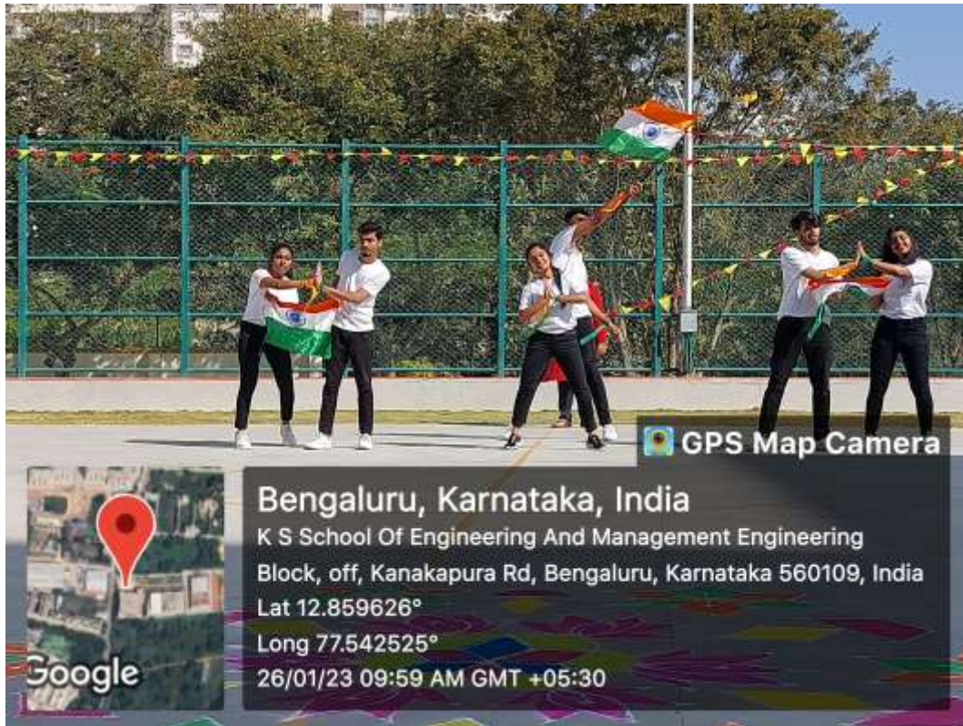
Cultural Presentation on the day of Republic Day