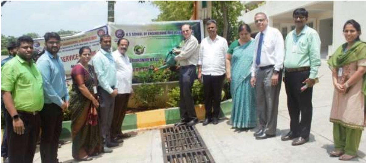
The World Environment Day