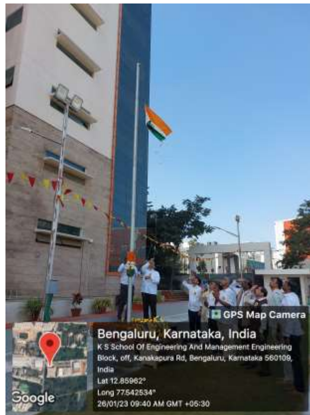
Flag Hoisting by President KSGI on occasion of Republic Day