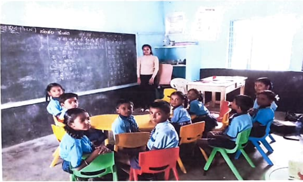
Event 3 Photos: