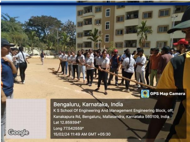
Fig 4: Girls involved in Tug of War Event.

DEPARTMENT OF ELECTRONICS AND COMMUNICATION ENGINEERING