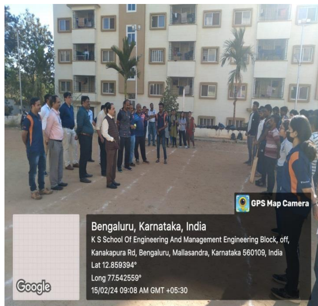
Fig 1b: Student-Principal Interaction on the Sports Day.