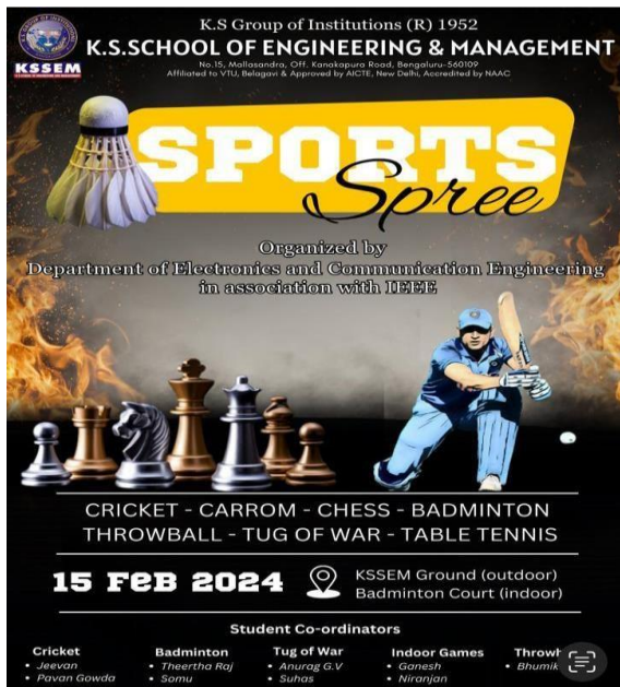
Fig 1a: Brochure of the Sports event.