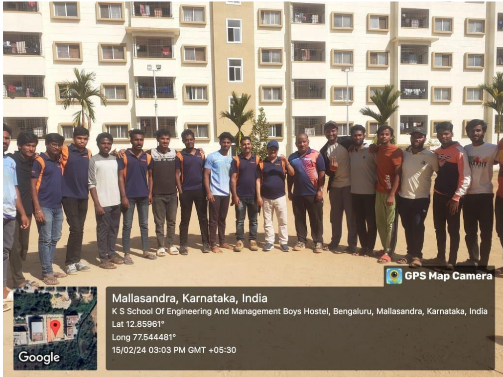
Fig 3: Group Photo along with Mini Cricket Finalist.

DEPARTMENT OF ELECTRONICS AND COMMUNICATION ENGINEERING