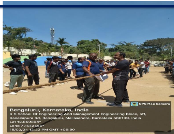
Fig 5: Faculty coordinating in the Men's Tug of War Event.

Tug of War: A total of 6 Women's teams were involved in the game and the result is as below.