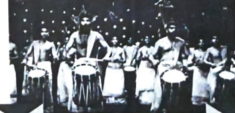
Shinkari Chande Melam