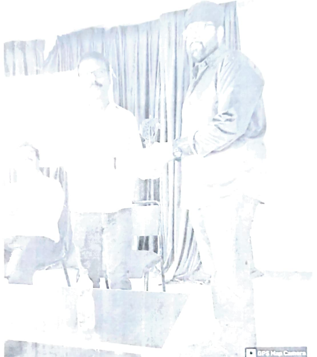
Bengaluru, Karnataka, India K.S. School Of Engineering And Management Engineering Block, off, Kanakapura Rd, Bengaluru, Mallasandra, Karnataka 560109, India Lat 12.859852° Long 77.643048° 09/06/24 11:50 AM GMT +05:30